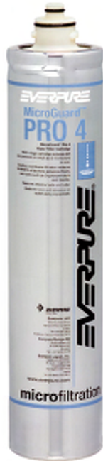
MicroGuard™ Pro 4 Replacement Cartridge: EV9637-02

Delivers premium quality drinking water for bottleless coolers and drinking fountains