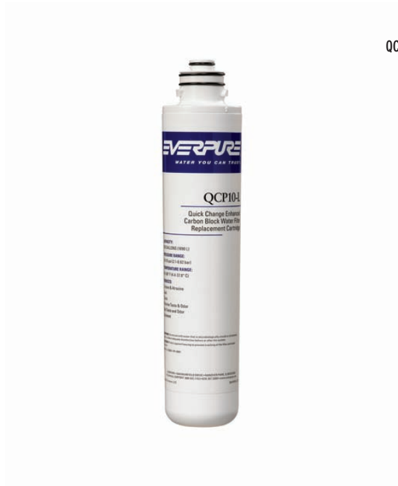
QCP10-L Replacement Cartridge: EV9107-00

Delivers premium quality water for office and vending applications